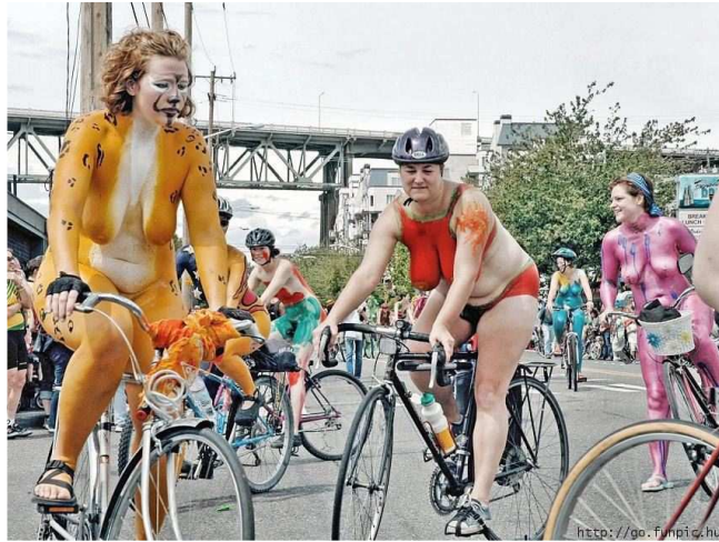
On Wheels To&From